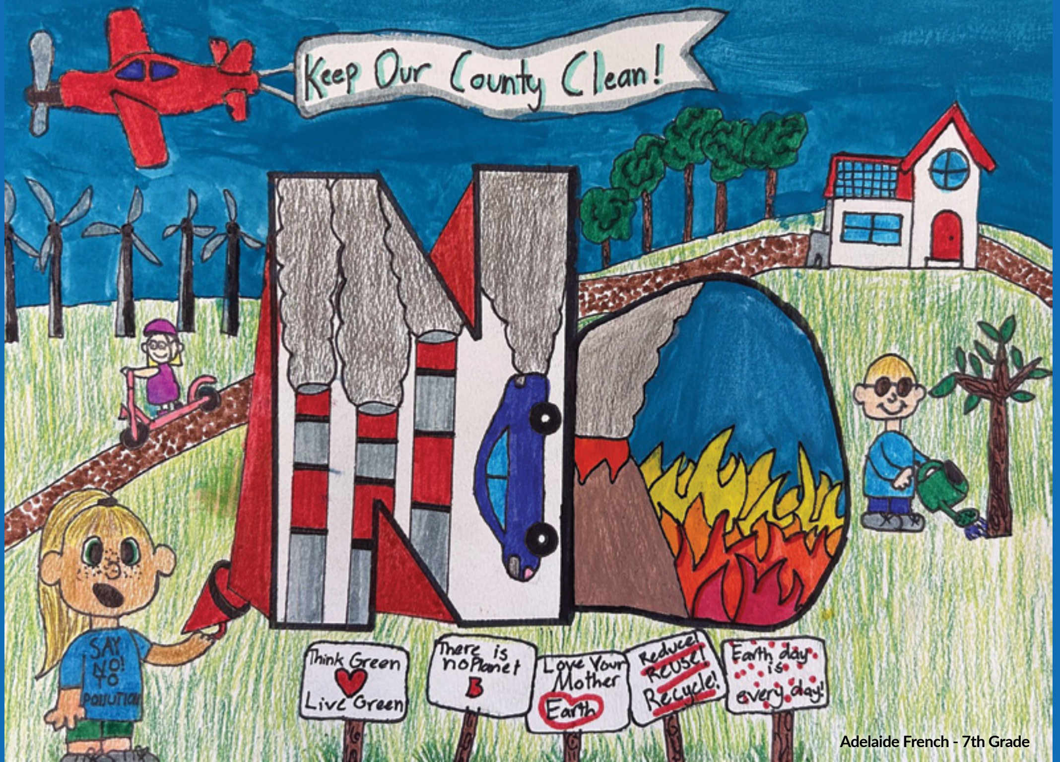
Adelaide French - 7th Grade