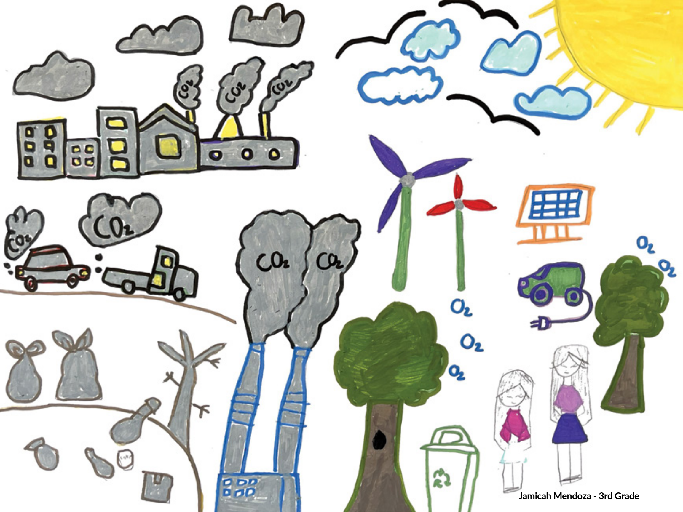
Jamicah Mendoza - 3rd Grade